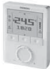
LCD Room Unit (CP Option)