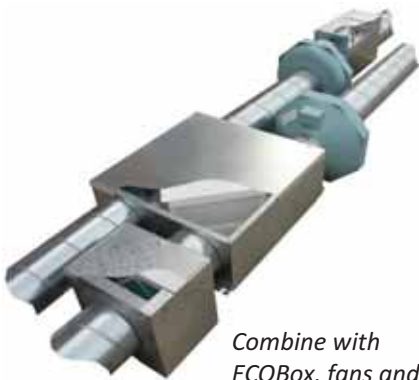
Combine with ECOBox, fans and filters for efficient heat recovery

The VES HEATLINE Duct Mounted Electric Heater Battery brings new versatility to existing and new ventilation installations. Intelligent control options can synchronise with a BMS or LCD room unit. Coupled with a Thyristor heater, this is the ideal solution to accurately heat individual rooms. HEATLINE is also both simple to install and maintain.